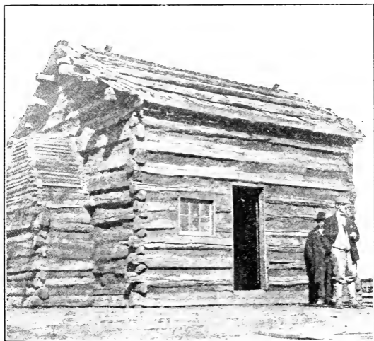
LINCOLN'S BIRTHPLACE, NEAR HODGENVILLE, KY.